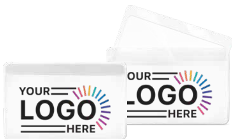
1201 Credit Card Magnifier Min. 200*

Useful and clever promos have great brand "Staying Power". Customers will keep them long after they toss the letter, and will be reminded of you with every use. Here's a few fresh, flat & mailer-ready promos to up your next campaign.